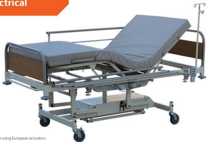
Shown with optional foam mattress, sideguards and IV Pole

When it comes to personal patient care our electrical hospital beds line up has something to offer for every situation. Our bed model 230-EN has all the standard requirements that a hospital needs for patient care, with comfort